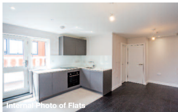
Internal Photo of Flats