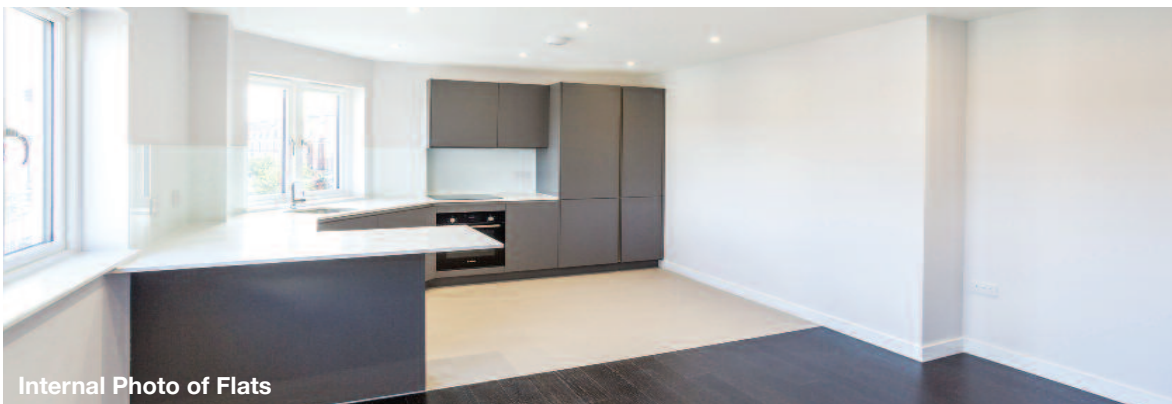
Internal Photo of Flats

Band D (shop). See legal pack at www.acuitus.co.uk .