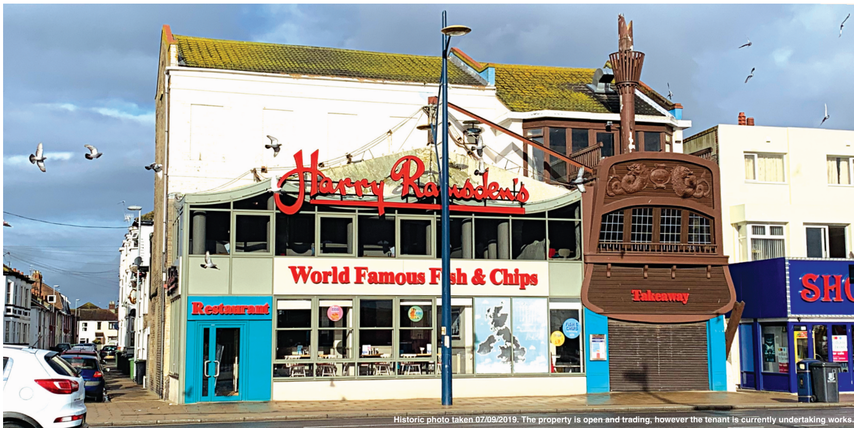
Historic photo taken 07/09/2019. The property is open and trading, however the tenant is currently undertaking works.

Freehold Restaurant Investment with Long Lease