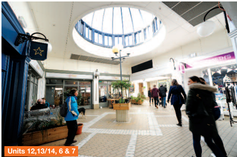
Units 12,13/14, 6 & 7