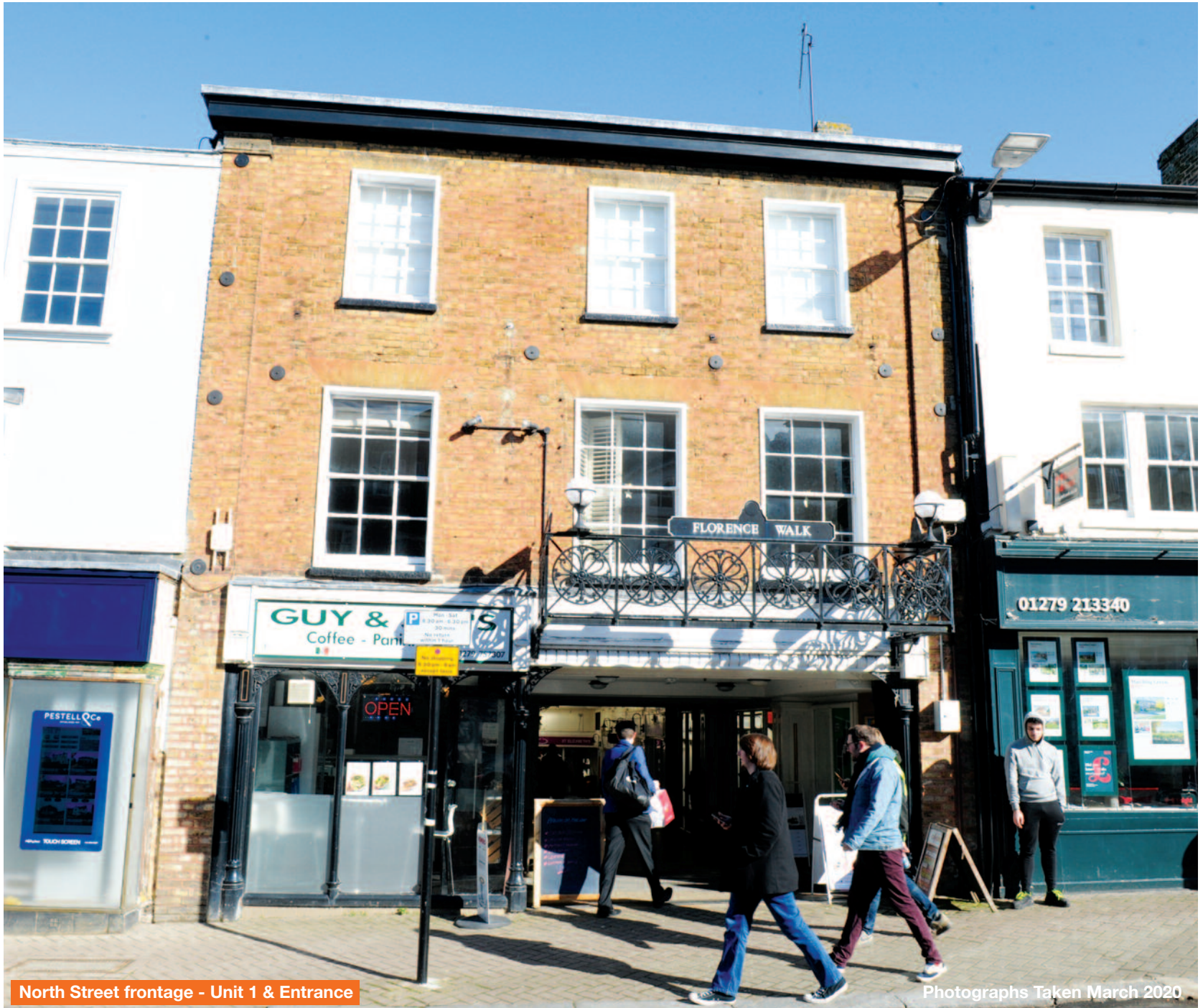
North Street frontage - Unit 1 & Entrance