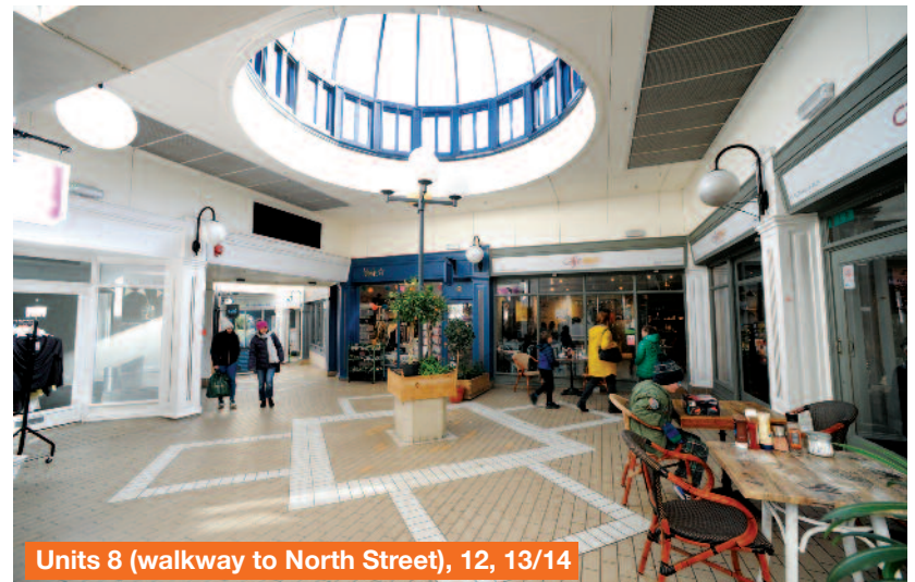
Units 8 (walkway to North Street), 12, 13/14