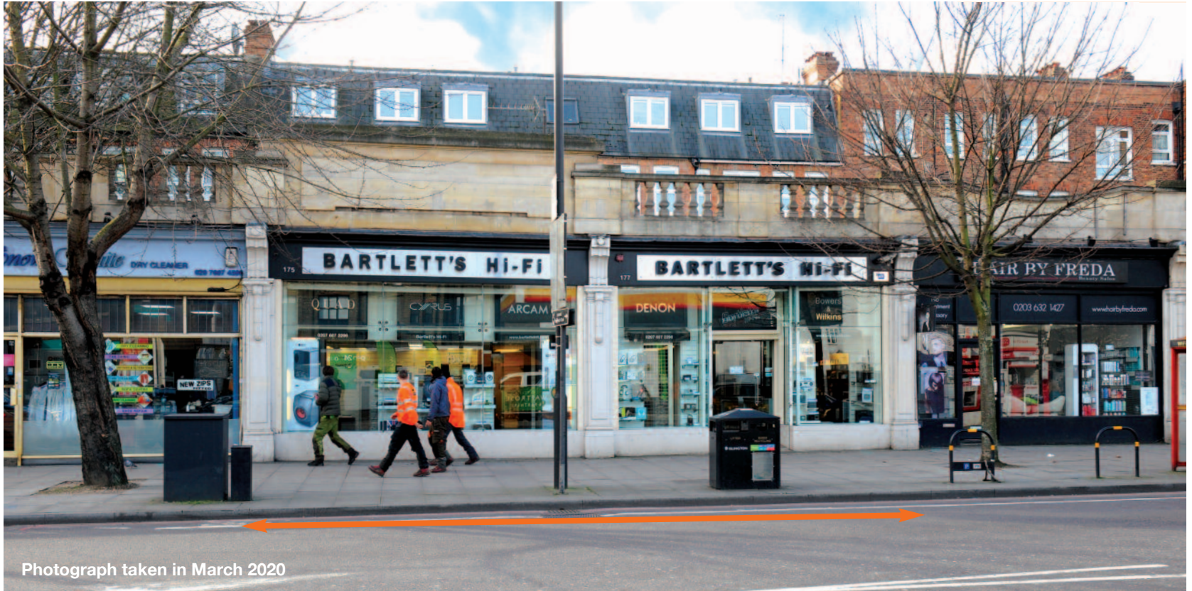
Photograph taken in March 2020