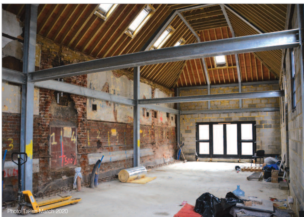
Photo Taken March 2020