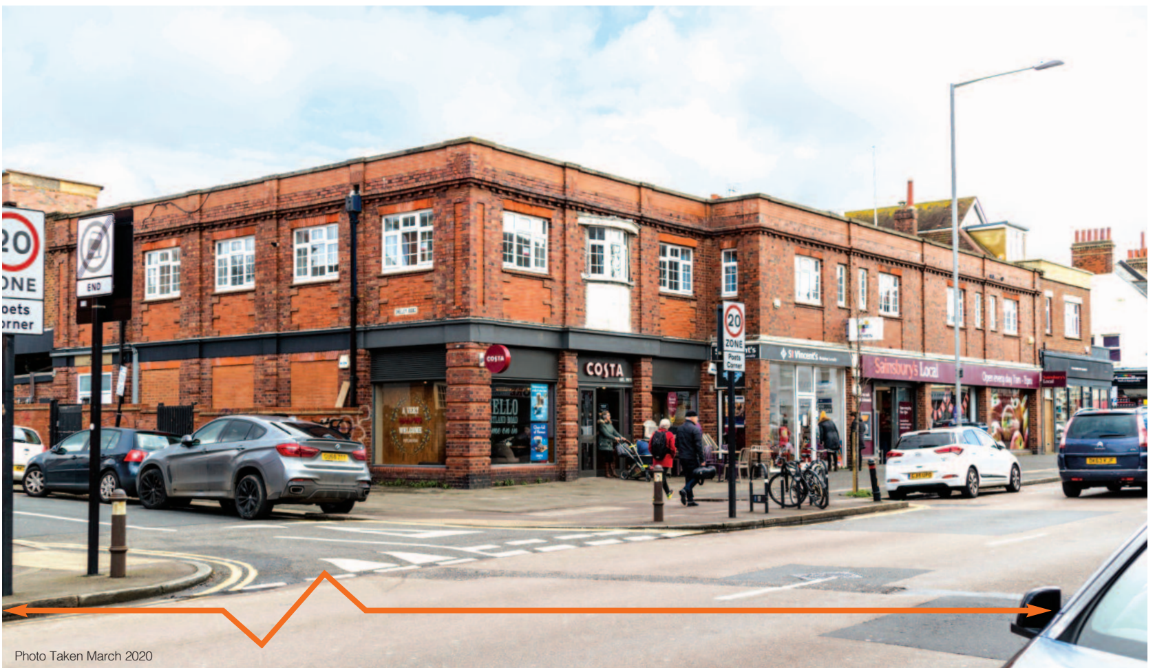
Photo Taken March 2020