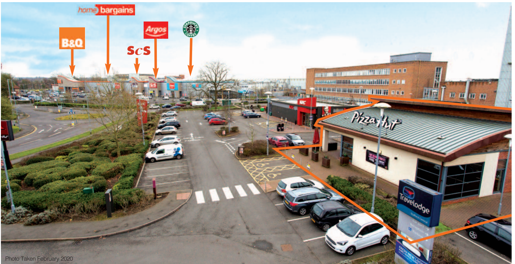
Photo Taken February 2020