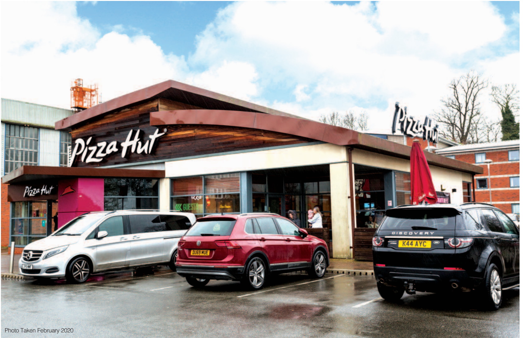
Photo Taken February 2020