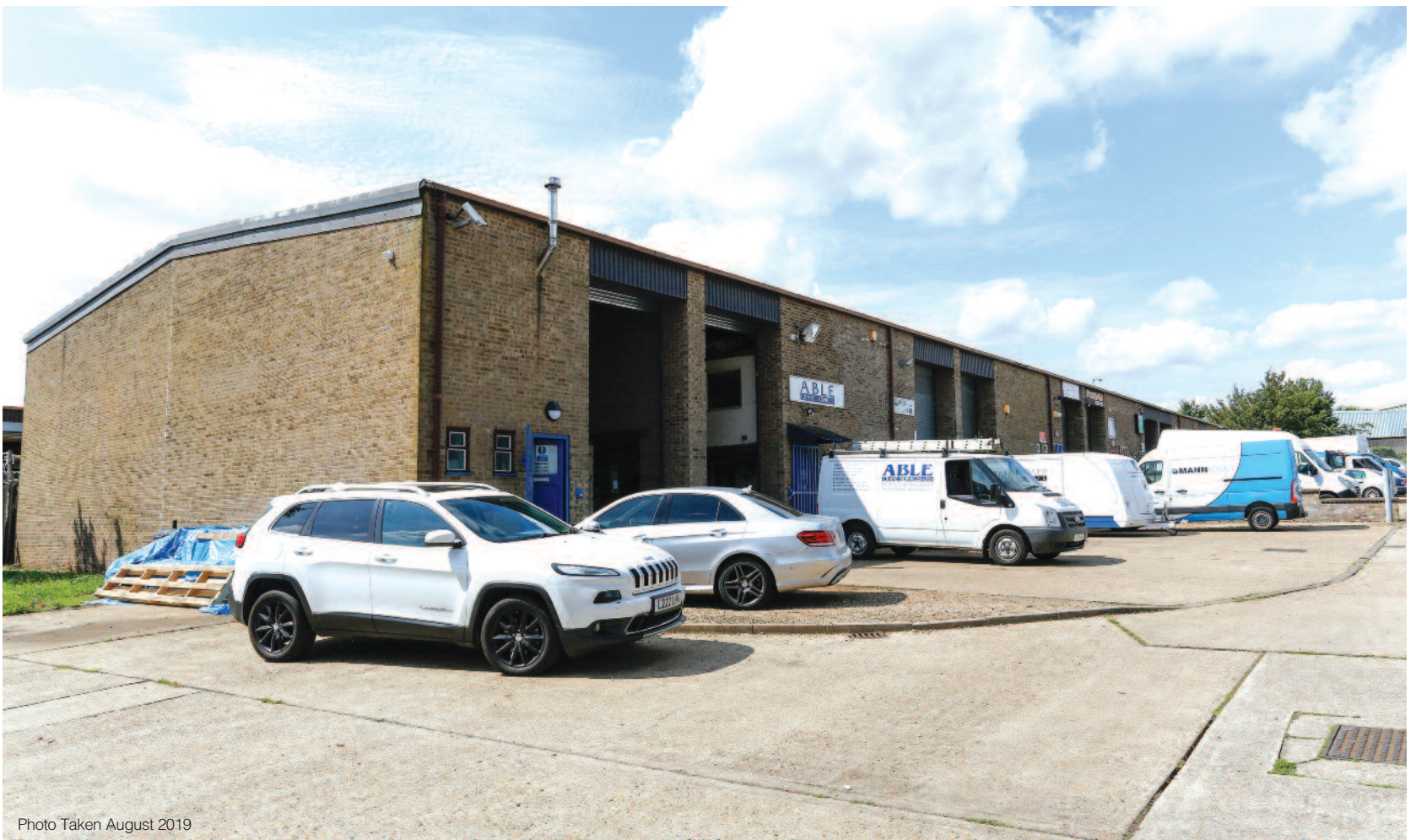
Photo Taken August 2019