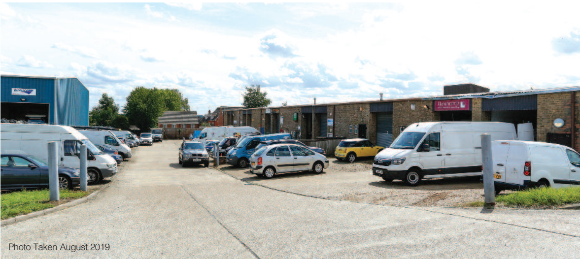
Photo Taken August 2019

Available from the legal pack at acuitus.co.uk