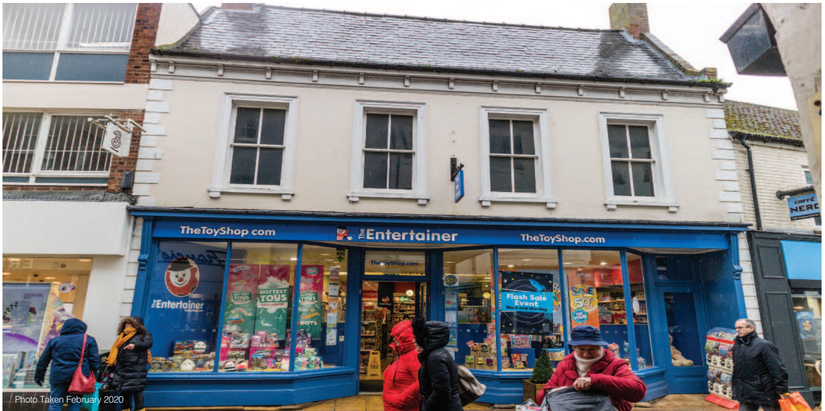
Photo Taken February 2020