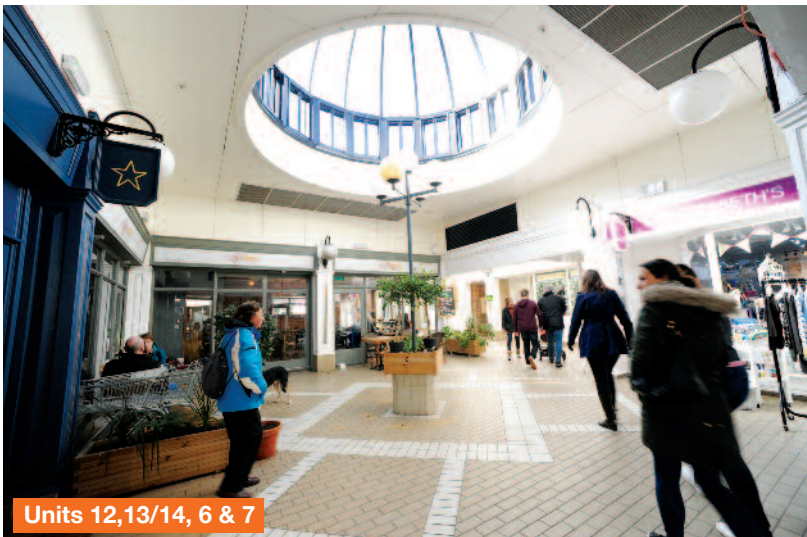
Units 12,13/14, 6 & 7