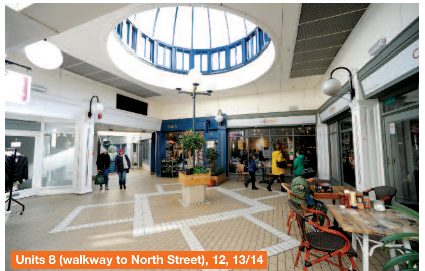
Units 8 (walkway to North Street), 12, 13/14