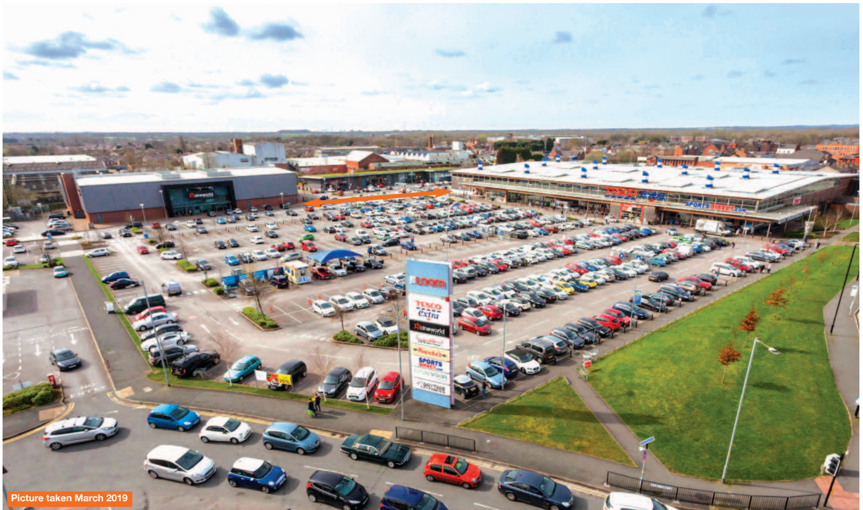
Picture taken March 2019