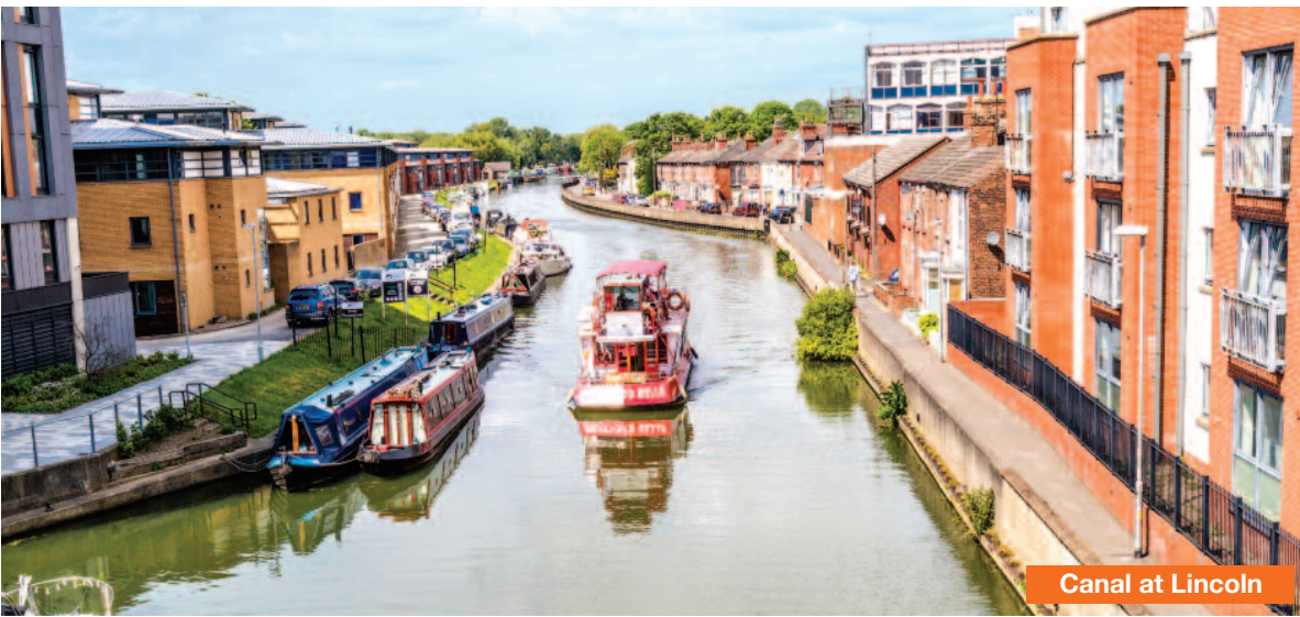
Canal at Lincoln