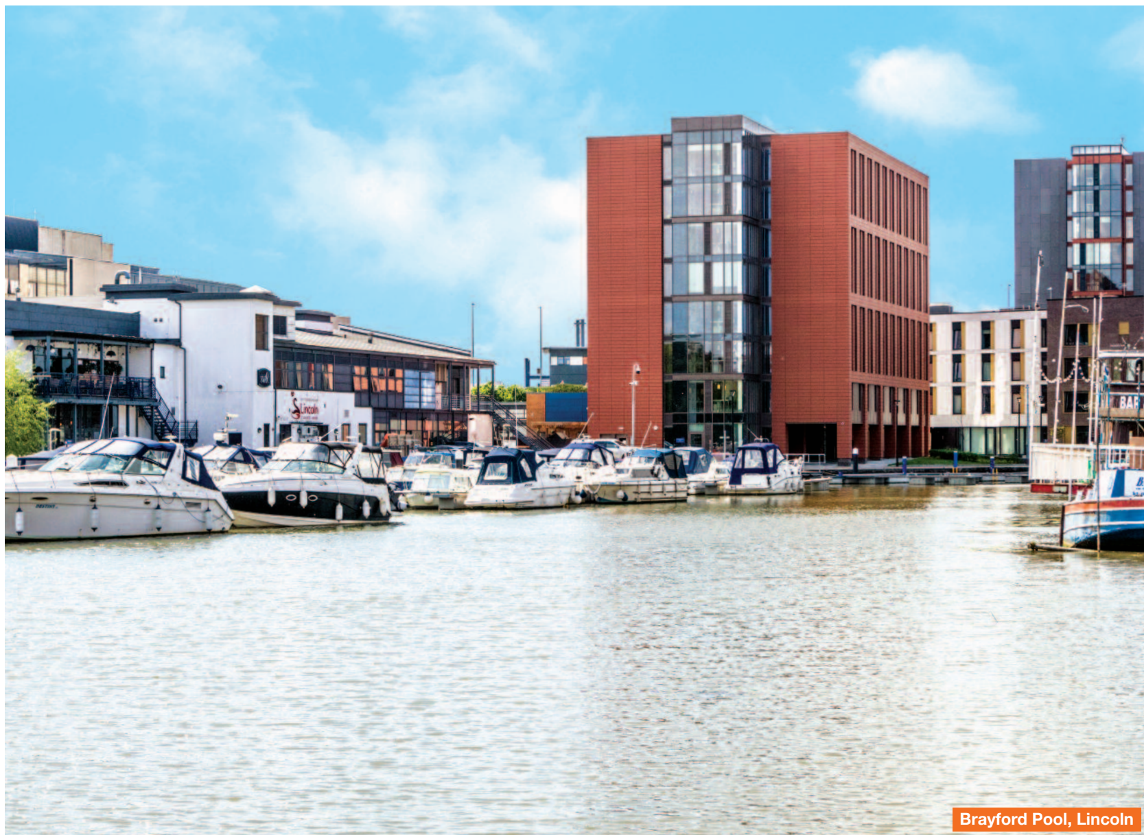
Brayford Pool, Lincoln

Long-Dated Investment secured on UK's Oldest Man-Made Waterway