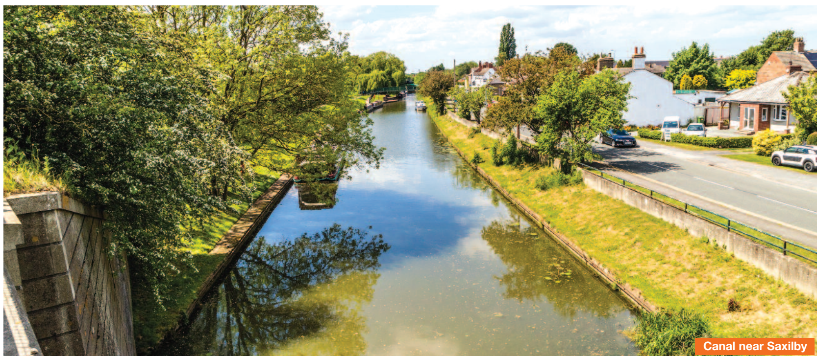
Canal near Saxilby