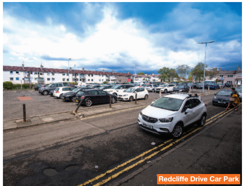
Redcliffe Drive Car Park