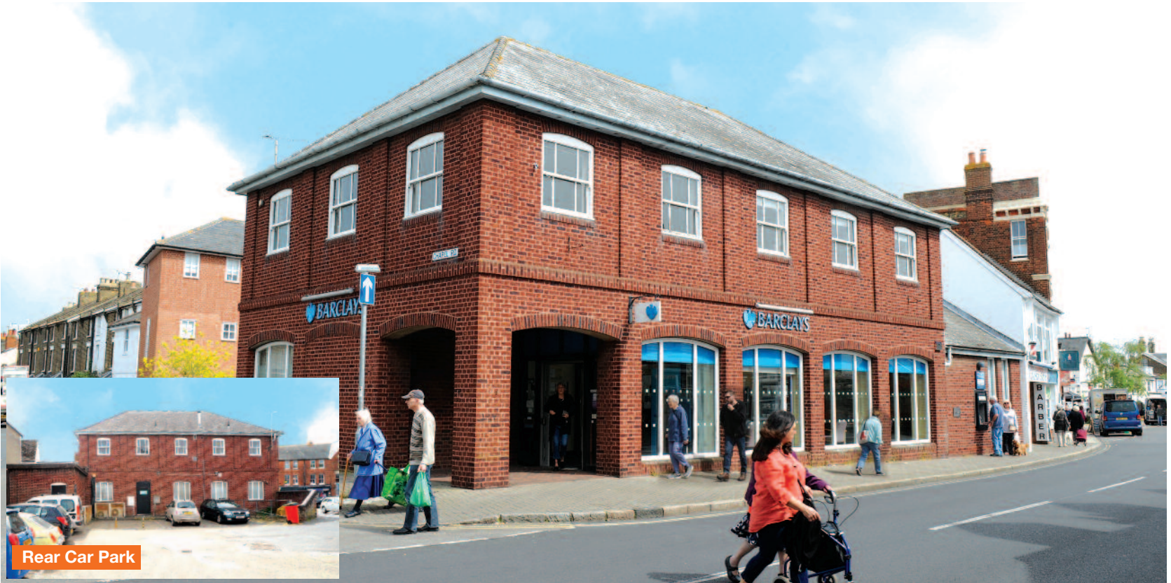
Rear Car Park