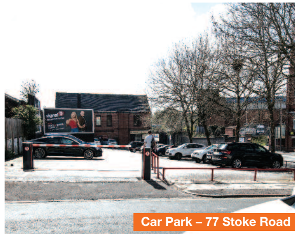
Car Park – 77 Stoke Road