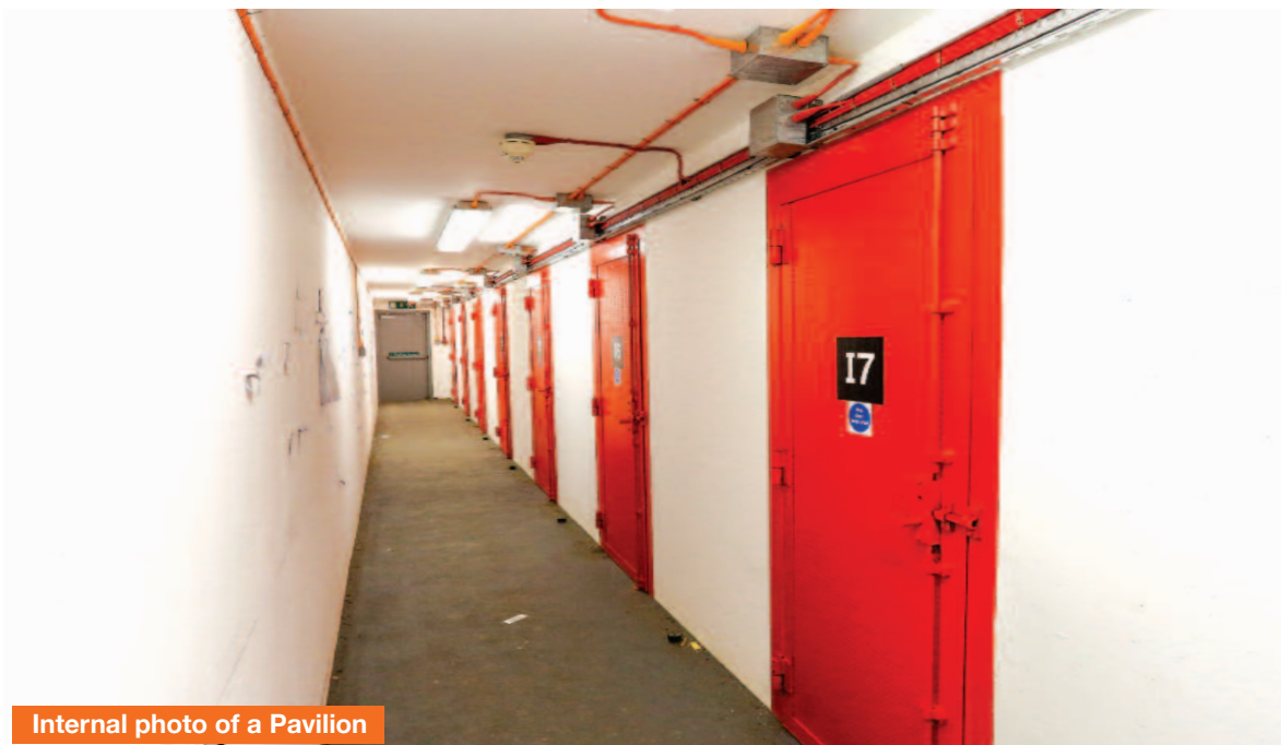
Internal photo of a Pavilion