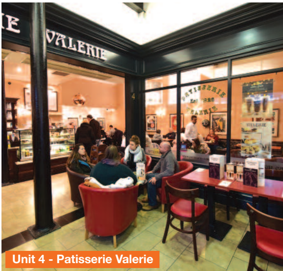
Unit 4 - Patisserie Valerie

Available from the legal pack at acuitus.co.uk