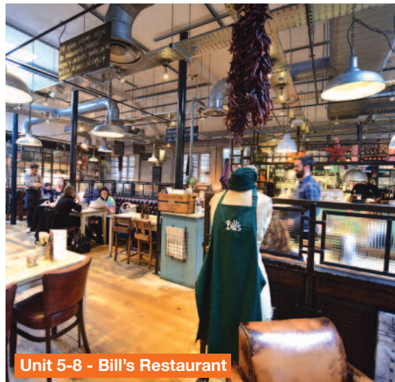
Unit 5-8 - Bill's Restaurant