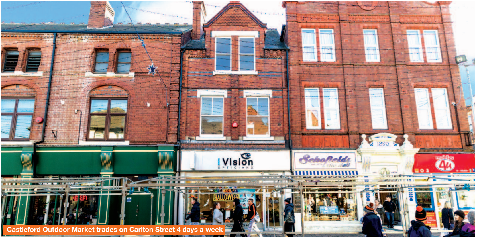
Castleford Outdoor Market trades on Carlton Street 4 days a week