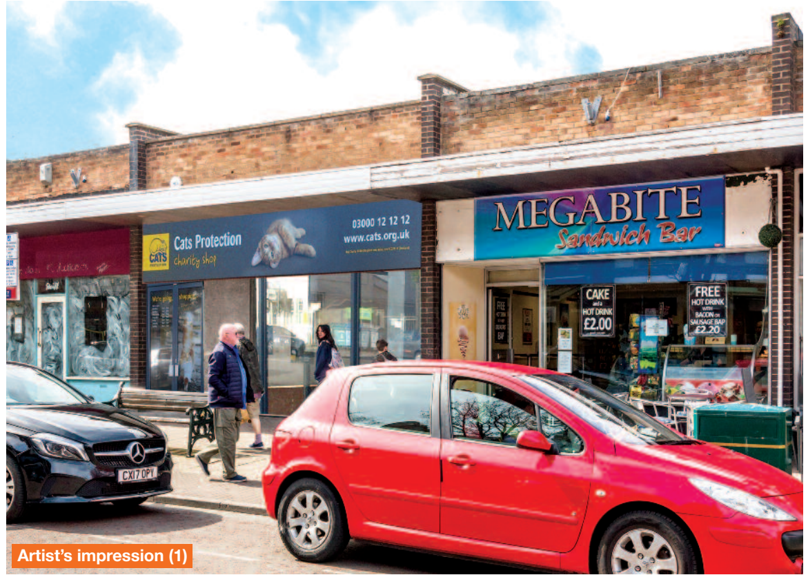
Artist's impression (1)