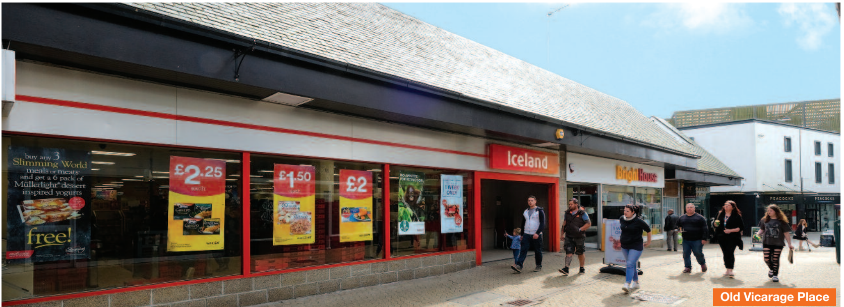
Old Vicarage Place