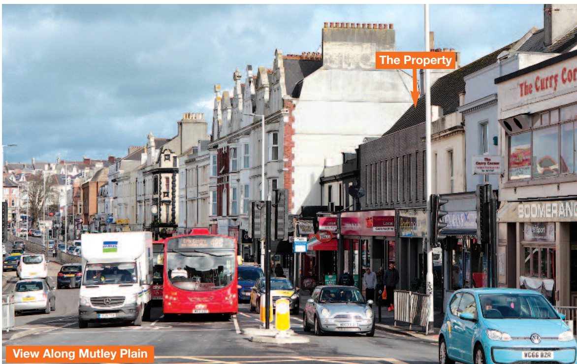
View Along Mutley Plain