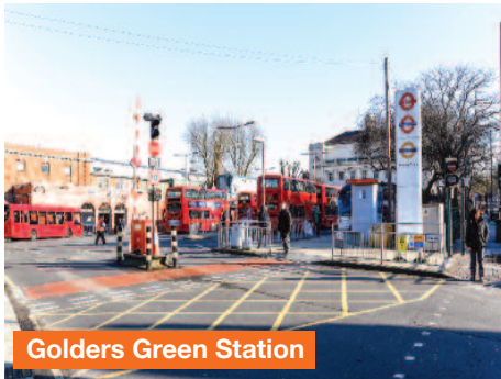
Golders Green Station