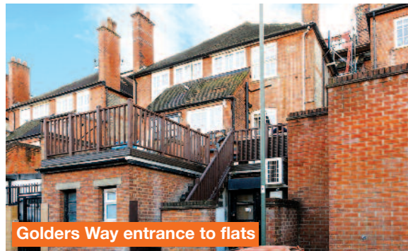
Golders Way entrance to flats