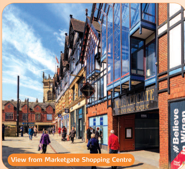
View from Marketgate Shopping Centre

Copyright and confidentiality Experian, 2013. © Crown copyright and database rights 2013 Ordnance Survey 10007316. For identification purposes only.