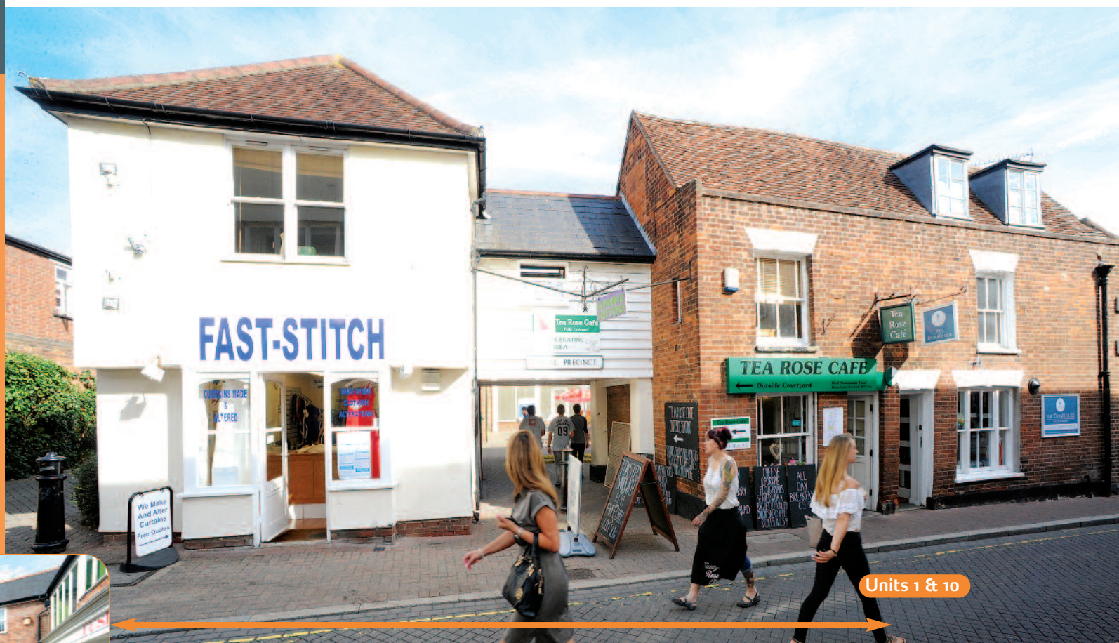
Units 1 &amp; 10