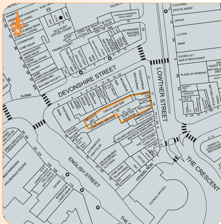
Extract reproduced from the Ordnance Survey mapping with the permission of The Controller of Her Majesty's Stationery Office For identification purposes only.