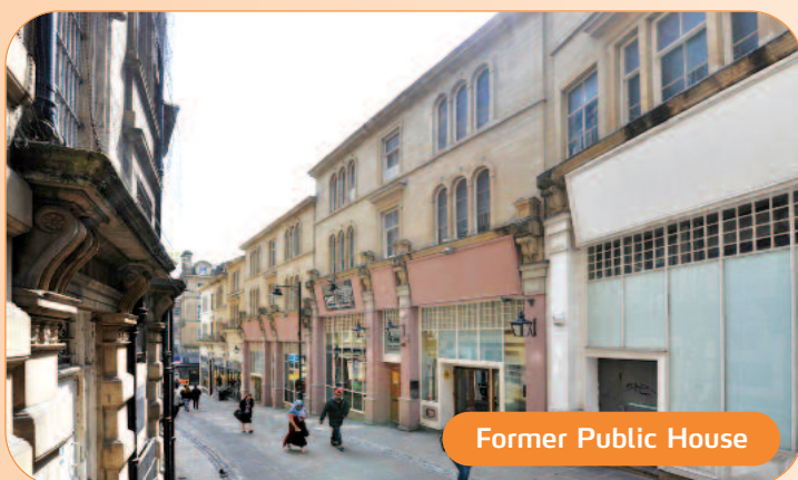
Former Public House

Copyright and confidentiality Experian, 2013. ©Crown copyright and database rights 2013 Ordnance Survey 10007316. For identification purposes only.