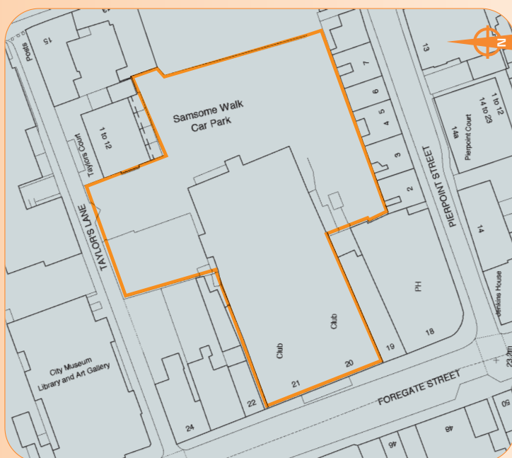
Extract reproduced from the Ordnance Survey mapping with the permission of The Controller of Her Majesty's Stationery Office ©Crown Copyright 100020449. For identification purposes only.