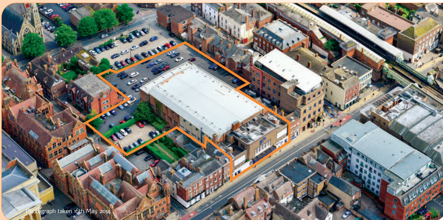
Photograph taken 16th May 2014