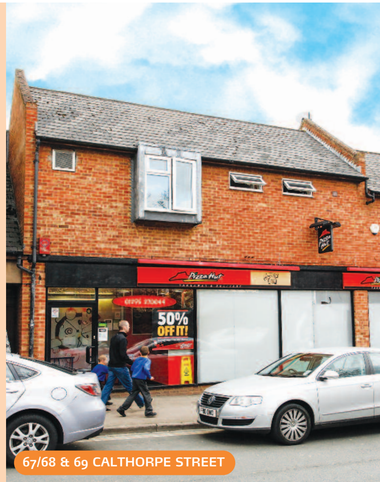
67/68 & 69 CALTHORPE STREET