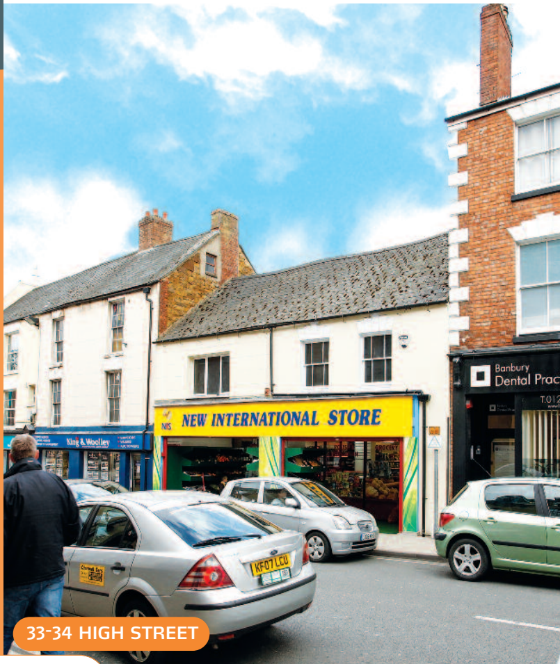
33-34 HIGH STREET