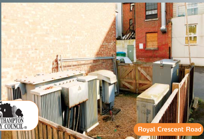
Royal Crescent Road