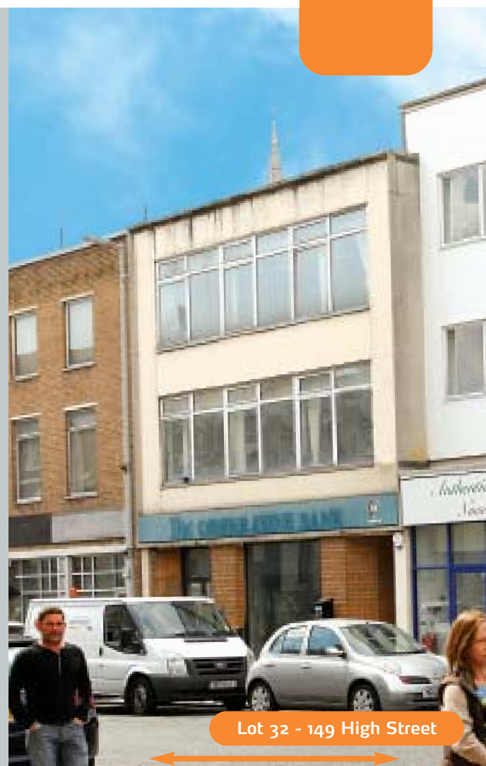
Lot 32 - 149 High Street