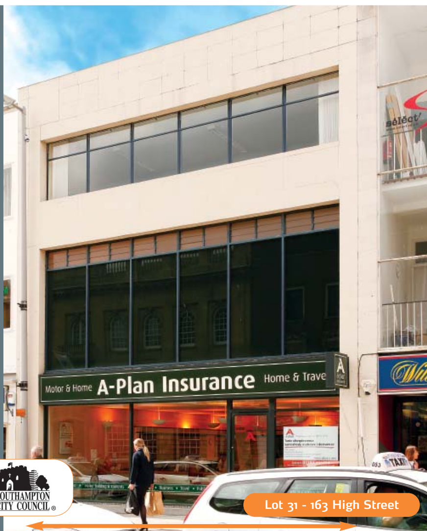
Lot 31 - 163 High Street