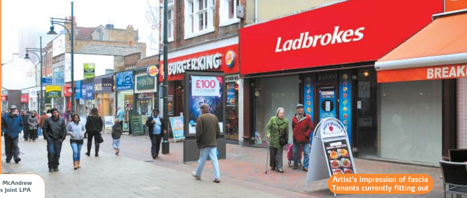
Artist's impression of fascia Tenants currently fitting out