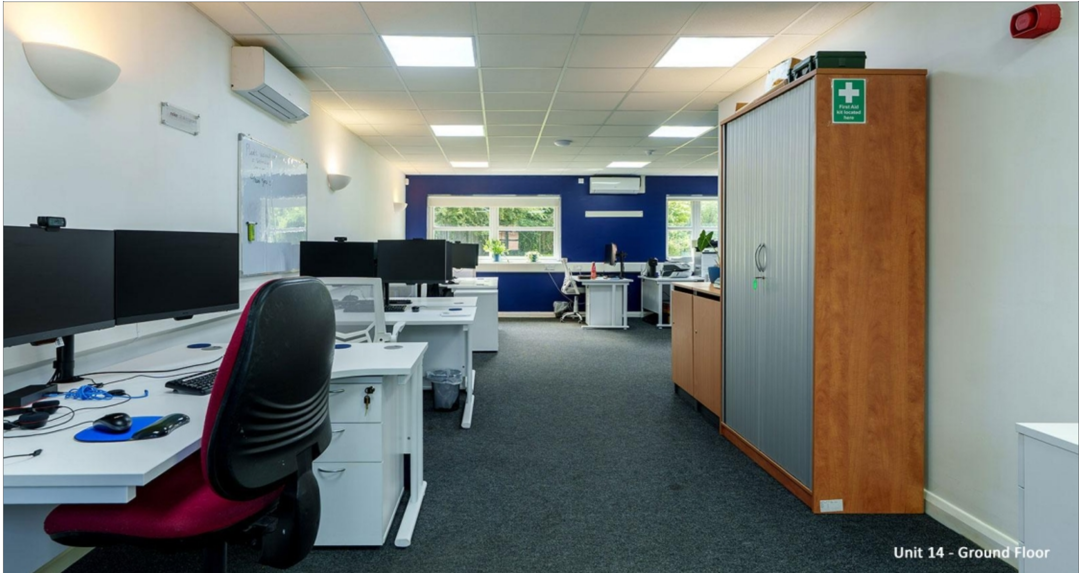
Unit 14 - Ground Floor

For sale by Auction on 16th July 2026 (unless sold or withdrawn prior)