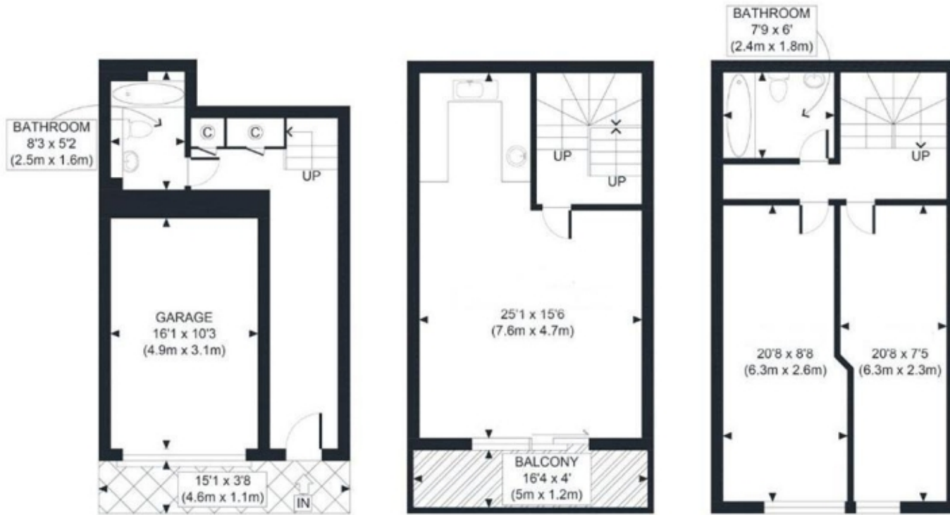
GROUND FLOOR GROSS INTERNAL FLOOR AREA WITH GARAGE 382 SQ FT FLOOR AREA WITHOUT GARAGE 182 SQ FT

For sale by Auction on 16th July 2026 (unless sold or withdrawn prior)