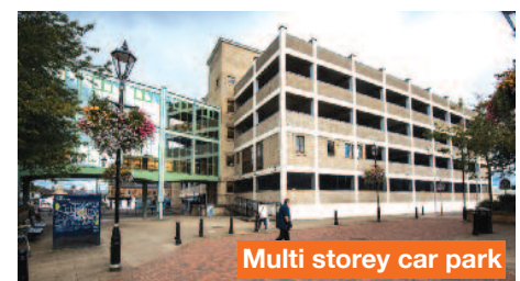
Multi storey car park